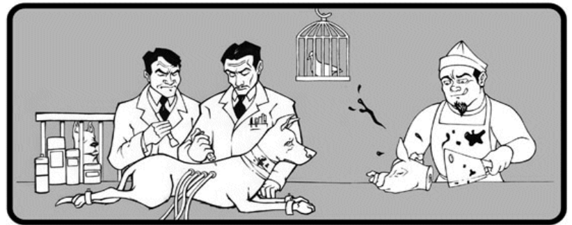
Hell on Earth or The Peaceable Kingdom