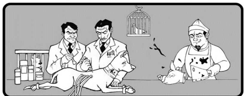
Hell on Earth or The Peaceable Kingdom